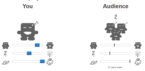
Figure 2. Audience view. On the left side the user can vote by adjusting the sliders for happiness , comprehension and speed . On the right side the perception of whole audience is shown

The near real time communication between the auditors and the lecturer is realized with WebSockets (Socket.IO<sup>5</sup> Server version 0.9). To reduce complexity and possible performance bottlenecks, depending on the audience size and the number of simultaneous held lectures, the publish-subscribe pattern is used. This pattern sates that the sender of a message needs not to know the receiver. Receivers (the audience) are subscribing to channels and the publisher (the lecturer) does not care about the number of subscribers [14].