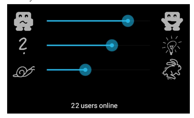
Figure 5. Feedback view for the lecturer throw the prism

Prototype display view: The prototype mirrors the lecturer view from the website to serve the lecturer as an additional consumption possibility of the feedback provided by the audience.