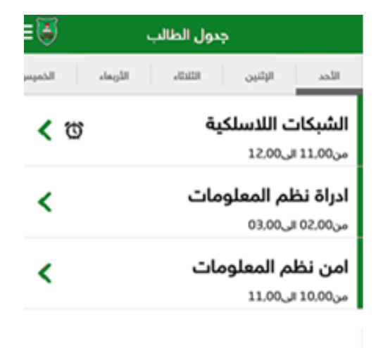
Figure 7. Timetable for the current academic term

After completing each academic term, students can access the term's results page. In this page, student can choose any previously completed academic terms. Then he can view a detailed list of all modules' marks, as well as that term average grad and cumulative grade. As shown