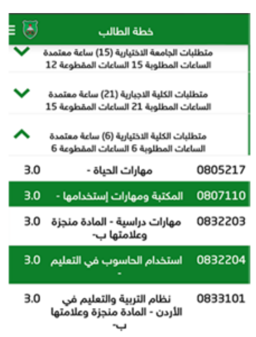
Figure 6. A snapshot of study plan screen

Students' module timetable for the current academic term, as well as the details of each registered module can also be viewed through the student schedule screen. Accessed by tapping on student schedule option from the UJApp side navigation menu, students can view the list of module that they are registered with in the current term as shown in Fig. 7. The module details screen provide students with the ability to set an alarm to remind them before the lecture starts, as well as providing them with the location of the lecture.