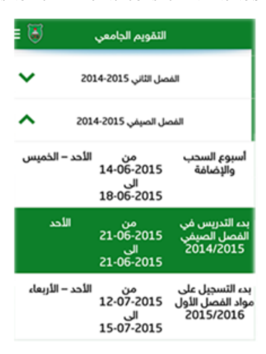
Figure 5. A snapshot of academic calendar screen