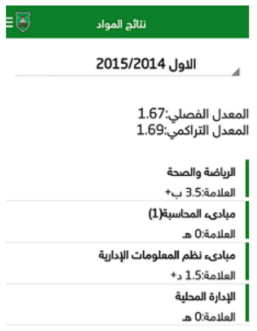
Figure 8. A snapshot of my grades screen

in Fig. 8, clicking on the "My Grades" tab on the main dashboard menu, the student would be able to see their track of grades for the term they are in. Moreover, Grades record would be automatically updated whenever changes have been made on them on the university website, and as long as the student's device is connected to the internet.