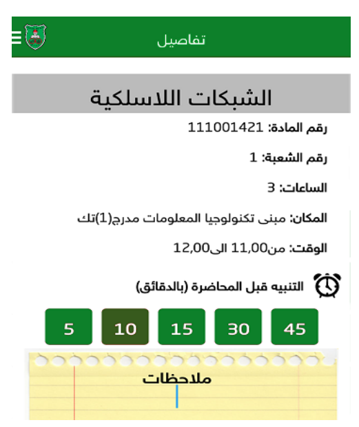
Figure 9. A snapshot of Alarm and Notes screen