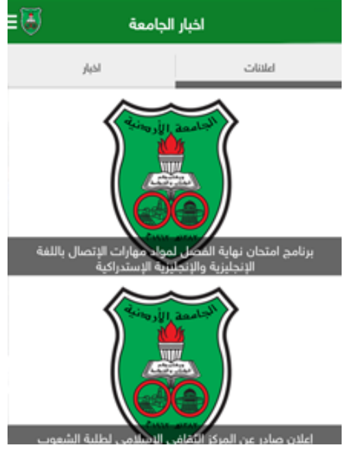
Figure 4. A snapshot of Announcements page