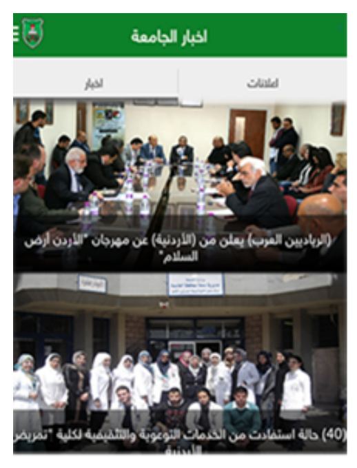
Figure 3. A snapshot of news page

Fig. 6 shows a snapshot of study plan screen. UJApp groups module into different types according to the student study plan. Whenever a student completes any of these groups, the application will mark this group as complete and they are no longer need to register to any of the modules within that group. This part of the application is very crucial to achieve the UniApp approach, as one of the main issues that cause inaccuracy in module registration.