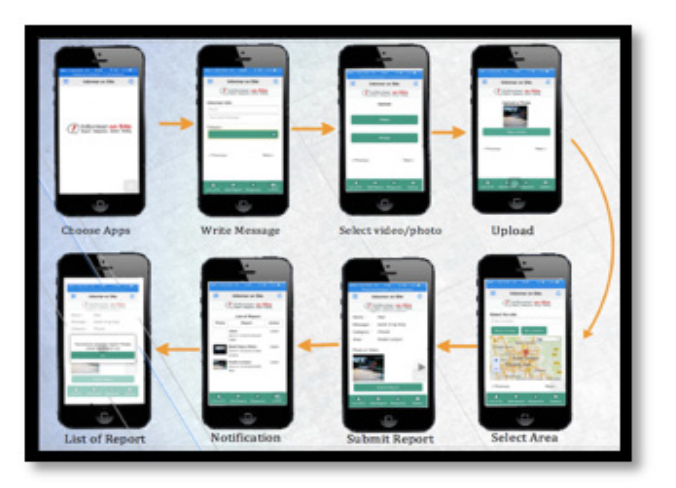
Figure 2. The flow of the process

The usage application is quite easy as it is user friendly. Figure 2 shows the process of using the Informer on Site application. First, the user needs to download the Informer on Site application. Then the user opens the application after downloading and writes a message. The details of the message could include name, complaint/type of disaster, etc. After that, the user attaches a photo or video as evidence of the disaster and uploads it. To expedite action by the authorities before they arrive at the scene, the user needs to select (search) using GPS. This application facilitates the GPS location for the authorities. Then the