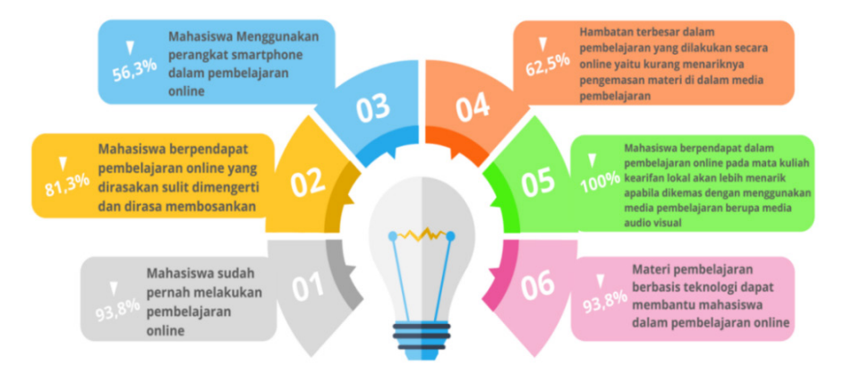
Fig. 2. Needs and characteristics analysis

In this research the TikTok-based online learning materials on toponymy throughout Palembang is developed to further fulfill the needs of effective and interesting materials for History Education student on the local wisdom of Palembang, specifically on the varieties of place names and the story behind them. For this purpose, several developmental steps and preparations were carried out to have a successful, valid result in this study, as can be seen in the following chart.