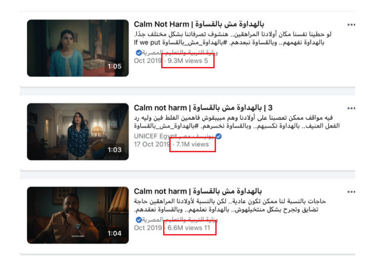
Fig. 1. Facebook "Calm-Not-Harm" videos

The success of "Calm-Not-Harm" campaign was measured also through social media metrics for the following channels: Instagram, Facebook and YouTube. The below figures indicates the number of viewership for the campaign, which are as follows: Youtube 2M viewers, Facebook 9M viewers and Instagram 59,331 viewers. The use of social media in the context of social marketing campaigns has favored increased motivation [12]. The mobile application and Web 2.0 system are frequently cited as having the ability to promote public involvement by establishing ties between government and citizens based on virtual information exchange and public discourse [32].