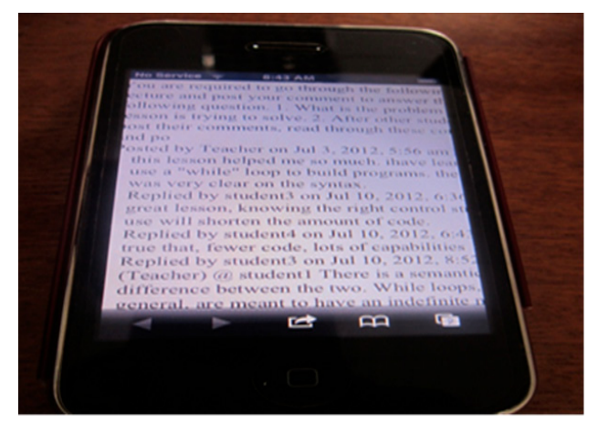
Figure 5. Some comments posted during Case study on iPhone 3G

bile devices: iPad, Samsung Galaxy S, Blackberry Curve8520, Sony Ericsson Xperia X10 and iPhone 3G were used by the students during the evaluation.