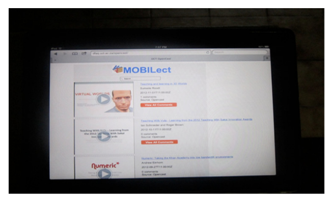
b) MOBILect on iPad