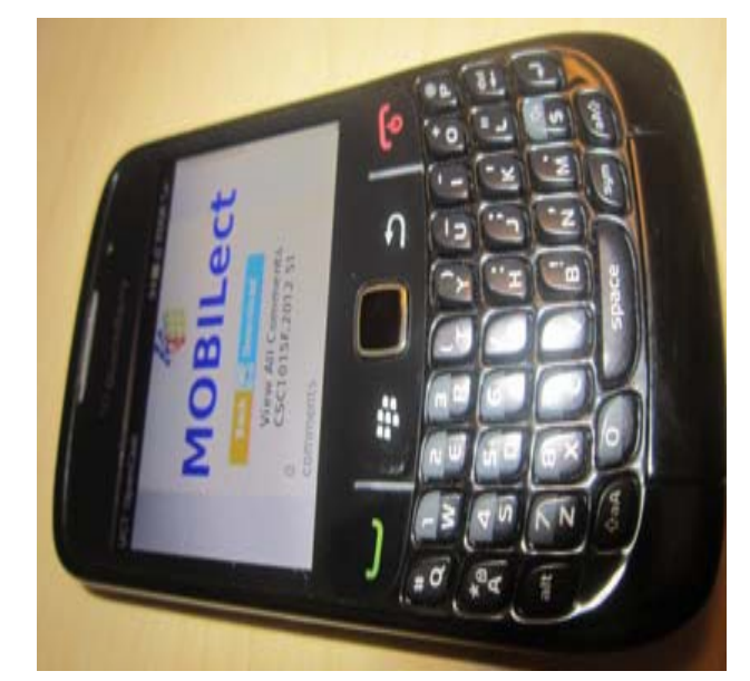
a) MOBILect on Blackberry 8520

Student-to-teacher interaction: Teacher viewed the entire comments posted on MOBILect by students to check for any misconception. Teacher posted some interactive comments to the students. Five different mo-