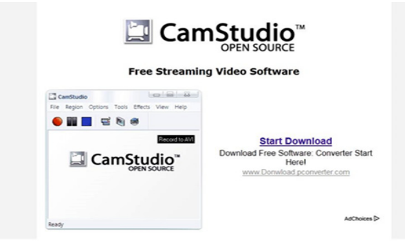
Figure 3. Camstudio [4]

full-time students and part-time students in the institution. Full-time students are always on campus throughout the year to receive instruction from teachers and sit for examinations. The part-time students visit the campus only few times in a year to receive instruction and then sit for examinations with their full-time student counterparts who had been steadily receiving instructions throughout the year. The part-time students are dispersed all over Zimbabwe and are employed, hence are engaged in parttime studies. They visit the campus only four times in a year to receive instruction. The consequence of this limitation is poor academic output. MOBILect was adopted to assist these part-time students to interact with the lecture vodcast on MOBILect to enhance their learning and foster deep learning.