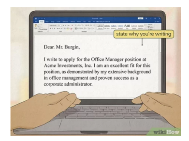
Fig. 3. Superstar App screen for Business English writing task 1

Scenario: You are surfing the Internet and looking for job vacancies. Suddenly, you see an recruitment advertisement of your desired position (such as Financial Planner, Accountant, Financial Analyst, Business Teacher, etc.) from a multinational company. You read very carefully about the job description and requirement and you make some notes while reading. You really would like to apply for it. Please write a letter of application to the person to contact by referring to the notes you've made.