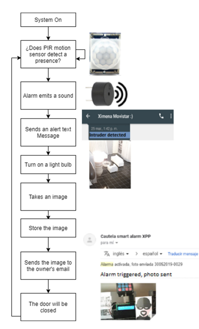
Fig. 2. Surveillance system

The gas leak detection system works when the gas sensor detects the presence of methane gas, then it sounds an alarm (buzzer), sends an alert text message, and displays an alert message on the screen. If the temperature is higher than 35 degrees, it shows the temperature as an on-screen alert message. In order not to send multiple text messages, it waits for 15 seconds, when the time passes and the system detects a gas leak again, it performs the procedure described above.