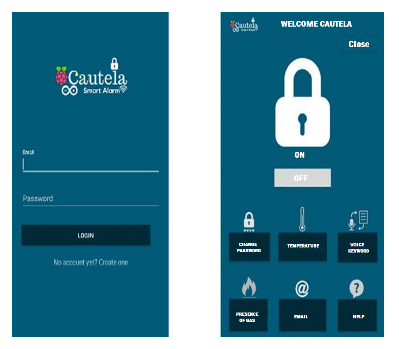
Fig. 3. "Cautela" mobile application [16]

The system has a mobile application (See Figure 3) that allows the user to manage and control the system from anywhere in the world with an Internet connection. Through the mobile application you can change the password used to enter the control panel (activate or deactivate), change the keyword (voice recognition system), and the email to which the image is sent. In the application you can view the status of the alarm (activated or deactivated), you can activate or deactivate any of the systems and you can observe the temperature and humidity of the home in real-time. Communication between the system and the mobile application is done through Firebase. Firebase is a platform that enables a cloud database and other services to develop web and mobile applications [15]. In the interim of using the Firebase database, when the user makes any changes to data, it is reflected both in the system and in the mobile application.