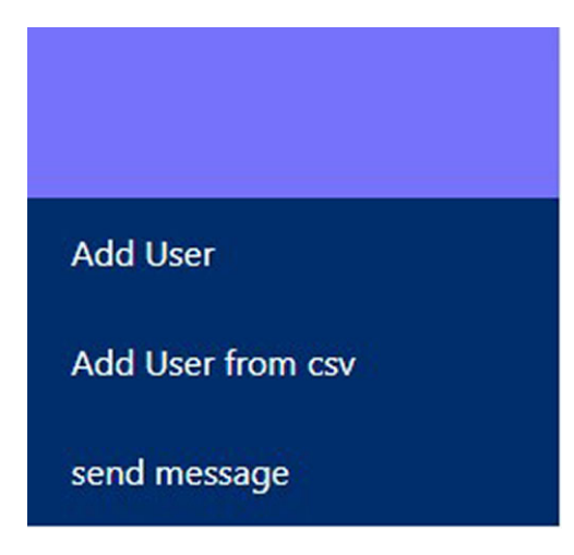
Fig. 18. The main interface

The main screen of the SMS Tool interface shown in Figure 18 contains three interfaces:- The first interface to add a new user, the second interface to download files of type (CSV), the third interface to display the users added in the database and send messages.