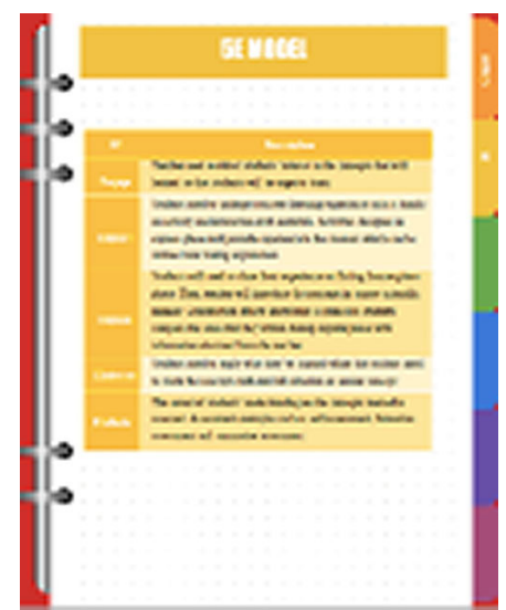
Figure 2 and Figure 3 shows the display of module cover and introduction of online module for acid and base topic based on 5E model respectively.