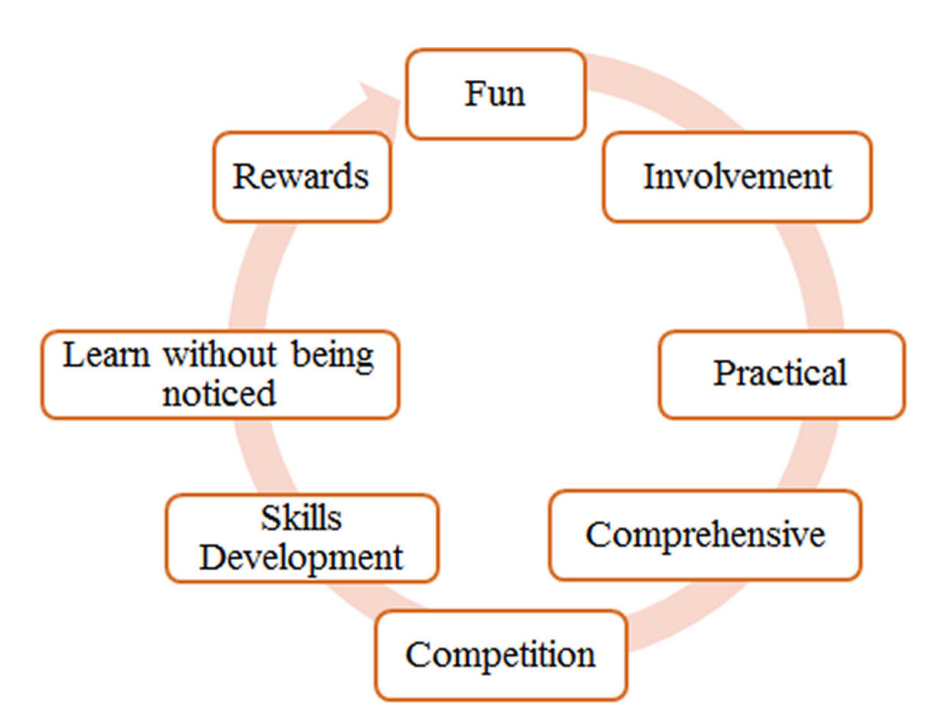
Fig. 1. Aspect of GBL in education [25]

attain after a series of matches or competitions between the main character and the game settings. Hence, the nature of the competitions in the game should be carefully created to enhance a player's skills in strategy building, problem solving and thinking speed. The player masters most of these skills unconsciously while playing passion-ately to obtain rewards in the game [64].