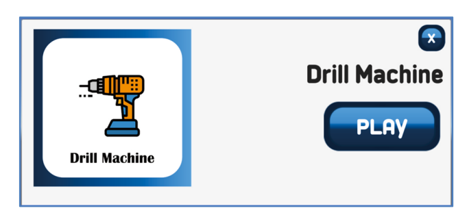
Fig. 2. Product homepage view

This research can result in a 3D object-based augmented reality technology innovation in the type of a drilling machine. Figure 2 shows the display of the product application that is currently being created.