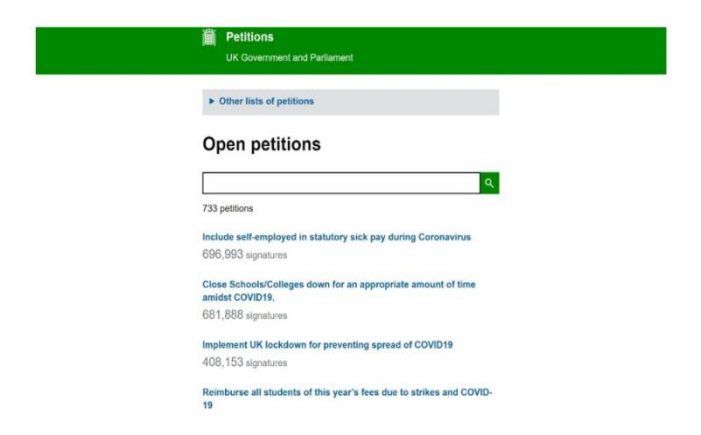
Fig. 2. Other Open e-Petitions that can be participate by local residents