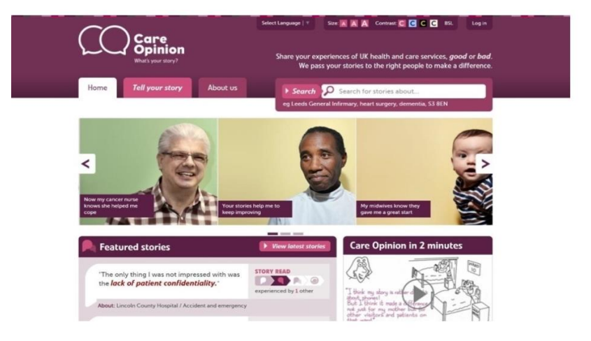
Fig. 5. A screenshot of Care Opinion website.

For instance, [14] once more provided an example of 'Patient Opinion' or 'Care Opinion' in the United Kingdom. The 'Patient Opinion' is a formerly name before being renamed as 'Care Opinion' today, is a non-earnings organisation provider that turned into released via a well-known Practitioner to enhance the United Kingdom national health service (NHS).