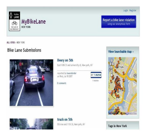
Fig. 3. Screenshot of mybikelane.com

'Mybikelane.com' the site can enable the local city enforcement authorities to enforce the laws to violators that illegally parked their vehicle on the bike lanes. As for this, it will help the local city authority to effectively and efficiently enforcing the law via the collaboration of citizen initiative of e-participation. However, the site has been shut down by the owner in 2012 due to some circumstance. Still, this is one of another good example public e-participation initiative via Web 2.0 to ensure the local enforcement is on the run.