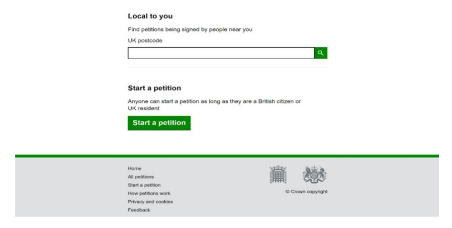
Fig. 1. Starting a petition by local residents

The below pictures are the example of the e-Petitions that have been initiated by the UK Government and Parliament: