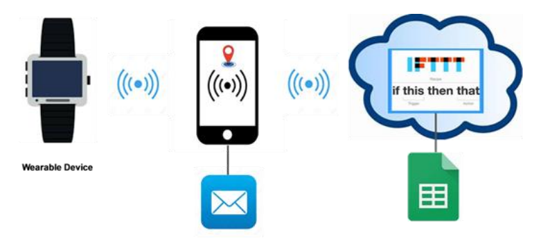
Fig. 1. System Model

Figure 1 shows the model of the proposed system. The wearable device is worn around the wrist like a wristwatch. The IoT enabled wearable device is equipped with heart rate sensor, temperature sensor and a panic button. The Android mobile is configured as mobile hotspot through which the wearable device sends the emergency data to the IFTTT (If-This-Then-That) [9] server. Also, it sends its location information to the concerned in case of emergency.