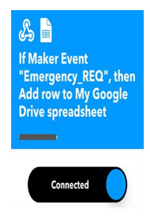
Fig. 7. IFTTT Applet

Macrodroid application is used to automate the tasks in the android mobile by creating macros. Each macro is associated with trigger, action, and constraint. Whenever the event specified in the Trigger occurs, specified Action is performed.