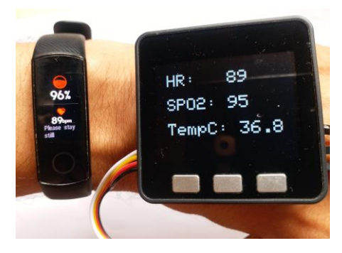
Fig. 9. Prototype of the IoT Enabled Wearable Device

The final protype of the IoT enabled wearable device is designed using M5Stack Core, MAX30100 and LM35. The heart rate and oxygen saturation measurement accuracy are compared using Honor Band 5, a popular smart band as depicted in Figure 9. The temperature measured by the device is compared with Thermomate mercury thermometer. It can be seen from the Table 1 that the results displayed for 5 people with different age groups by the proposed IoT enabled wearable device are almost close to the values obtained by smart band and thermometer.