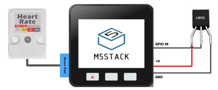
Fig. 5. Wearable device design

Figure 5 shows the wearable device designed using the heart rate and temperature sensor modules. The heartrate module is connected to the grove port using a grove cable and the analog output of LM35 temperature sensor module is connected to GPIO pin 36, which is the analog input of on chip ADC. Button A can be used as Panic/Emergency button.