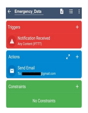
Fig. 8. Macrodroid Macro

as "Emergency Request" and the Email message text is configured to insert the Google sheet and last known location links. IFTTT Application installed in the mobile, displays the IFTTT notification in the notification bar, upon receiving a notification from the wristband. This notification runs the macro which in turn sends the email as specified by the Action field.