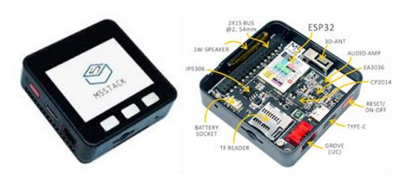
Fig. 2. M5Stack Core module