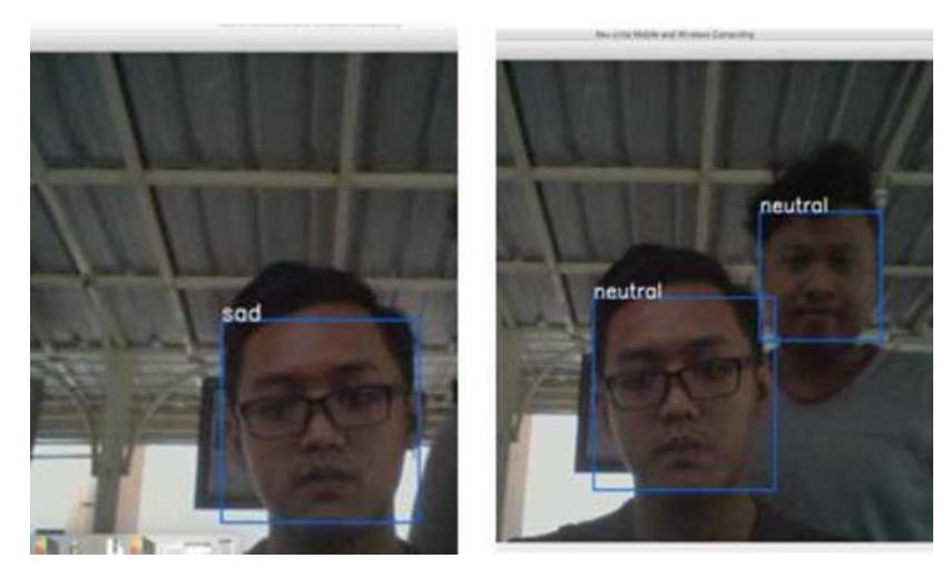
Fig. 2. (left) single facial expression detection, (right) multiface expression detection sensor Using the camera in a classroom

The results of the application of the camera sensor indicates the ability of the algorithm to detect individually (single face) and can also detect multi-person (multi-face) with the correlation of the correlation of natural and shows real-time truth of the average 93%, while showing experimental artificial truth value lowered by 88% indicates that the value of truth have met the standard identification of facial expressions is naturally more accurate.