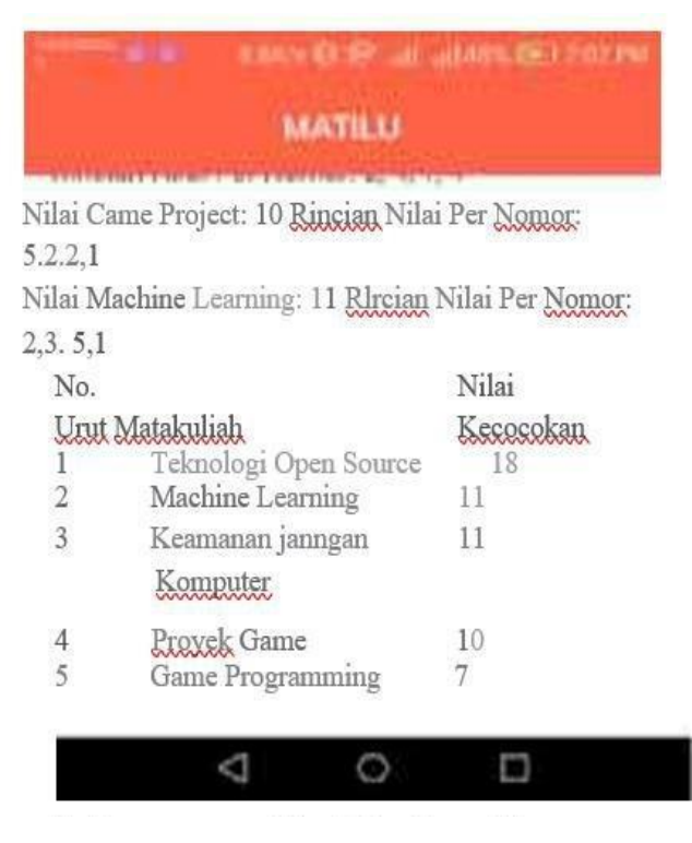
Fig. 3. Priority Content matching Based Q/A

Wireless technology also fell in parts of the technological aspects which concern other research projectsC. [19] and [20], RFID (Radio Frequency ID) and NFC (Near Field Communication) Media that is widely used to identify individual learners and educators in an effort to tailor the service, as well as perform additional functions. Very few research projectsA. [21], and [22] is regarded as the educational aspects of learner profile and content management issues are considered, while none of the projects reviewed in the literature focused on the social dimension. Aspects of technology, education and social services all require attention because if proper investigation to be carried out where a complete and realistic effort of intelligent learning environment is to be developed. (23), (24).