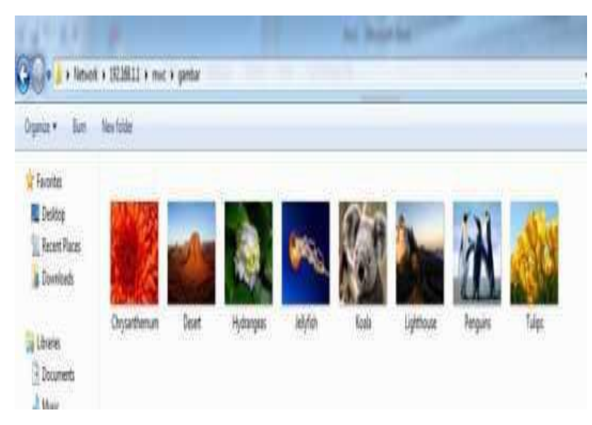
Fig. 4. Multimedia Personal Data Sharing Using Local Wireless Network based on their facial expressions and Priorities Content Matching