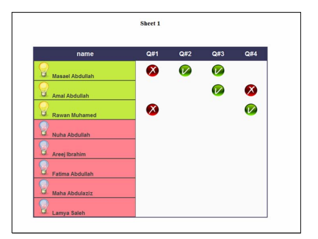
Figure 3. View of the tracking system showing students' who is currently solving 'sheet 1' assessment sheet, the names with green backgrounds and illuminated light bulbs mean logged in students.

On the other hand, the mean ratings of instructors' satisfaction were moderate, it scored 76%. The items affected by the instructors' ratings were items 7, 8 and 9. By further asking the instructors about their reasons of the selected