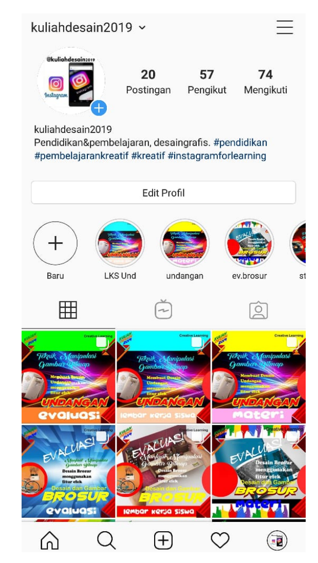
Fig. 2. Instagram display @ kuliahdesign2019 in learning graphic design

The findings from the UEQ test results with six scales, instagram user experience in learning graphic design with Instagram results on the scale of Attractiveness, Efficiency, Dependability and Stimulation are in an Excellent position, students feel the learning fun, not bored and bored. As well as on the Perspicuity scale Above Average position, on the Novelty scale Good position in learning graphic design students discover many new things, students find ideas and ideas quickly and enrich design insights, Instagram has a hashtag (#) that is full of visual power that can stimulate the imagination and the creativity potential of students in creating.