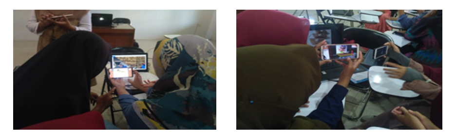
Thirdly, the users will be deepening the concept of gemetro which later will be chosen by clicking the button "let's learn geometri".

Secondly, the users understand the chosen geometry concept by clicking the button "Let's play AR".