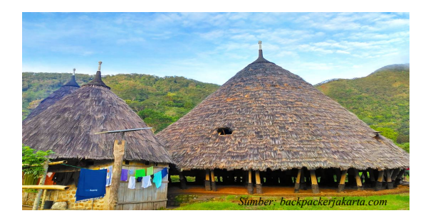
Fig. 1. Wa Rebo Traditional House

maintained until now. The representations of local wisdom in this study are chosen from the local wisdom forms that resembled geometric shapes such as Wa Rebo traditional houses, East Nusa Tenggara, Indonesia. Wa Rebo traditional house in a conical shape. Look at picture 1.