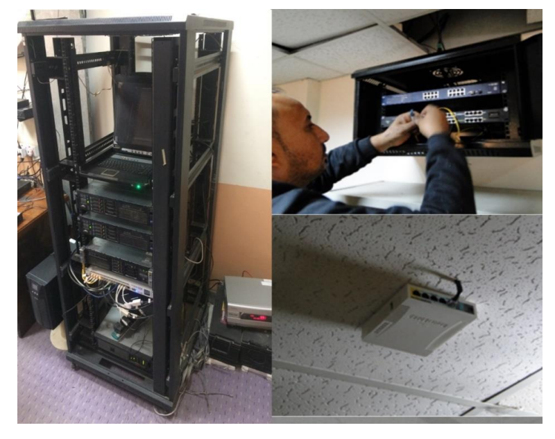
Fig. 2. Fiber optic and Wi-Fi installation.