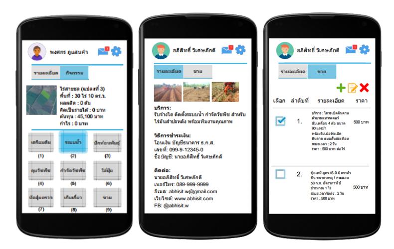
Fig. 3. Collaborative activities in CCSC mobile application

The CCSC mobile application allows agricultural service providers to add their services with service cost to the system. It also allows agricultural co-operative and buyer to add their contact and information for farmer selling their cassava chip. All of activities can be chosen by cassava chip farmer in mobile application which is managed by administrator (see Figure 3).