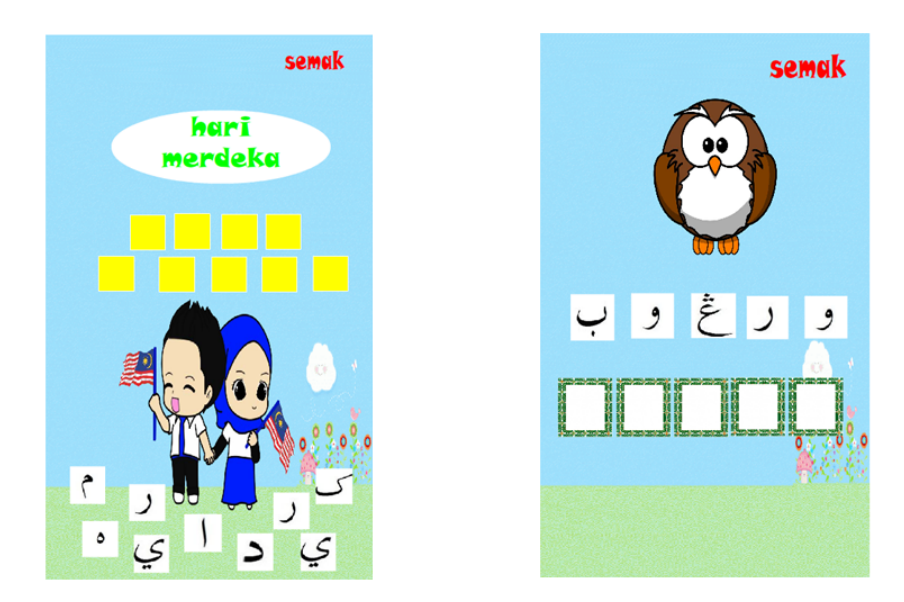
Fig. 2. Game Interfaces (Drag and Drop)

Figure 1 shows the flowchart of the process of the 'Oh Jawiku' app developed. This application is simple and consists of just a few pages with clear visual content so that students can easily browse and use this app without any help. There are four levels of the game in the 'jom eja Jawi' section designed according to the syllabus of Jawi year two primary schools.