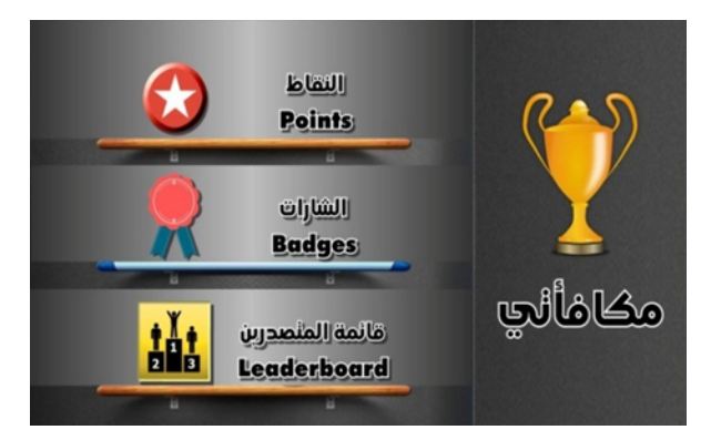
Fig. 1. Reward page with the proposed application