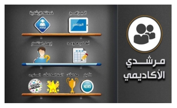
Fig. 2. Main interface of application

Educational content organization: Content is presented constructively so that the learner will be able to access the main ideas of the content through channels of social communication identified in channels (4), which were mentioned previously, and linked to the developed application.