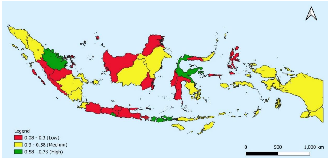
Figure 1. Distribution of The Macro Component of NZI in 2018

According to the calculation of NZI conducted by BAZNAS, the average index of all provinces in Indonesia shows that the performance and development of Zakat in Indonesia are quite good (BAZNAS Center of Strategic Studies, 2016). The score is 0.55, which is still in the middle and needs more effort to reach the stage where the zakat impact is excellent. However, the micro dimension of NZI is better as the score is 0.67, categorised as good. So, the factor that may inhibit the impact of Zakat lies in the macro aspect, which covers the institutional support from the regulation, State budget, and the database in the zakat institutions. Considering Indonesia is the biggest Muslim country in the world, the government should pay more attention to this by improving the regulation that supports the implementation of Zakat and increasing the budget to support the operation of zakat institutions.