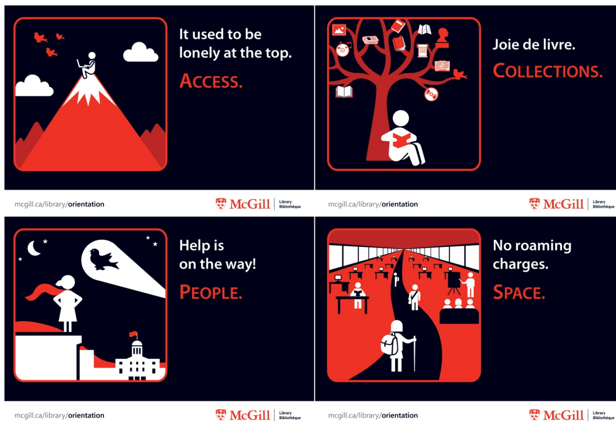
Figure 1. The promotional themes of library orientation at McGill University