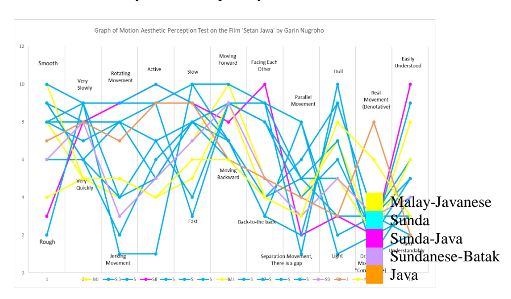
Figure 4. Perceptual Response Test Results of Movement Sensation (AK Dewi, 2019)

Backstage, one can allow to express aspects of themselves that may not be accepted by a certain audience, in this case the film but cannot do anything as it is limited by ethics. Backstage, one can allow to express aspects of themselves that may not be accepted by a certain audience, in this case the film but cannot do anything as it is limited by ethics. Backstage, one can allow to express aspects of themselves that may not be accepted by a certain audience.