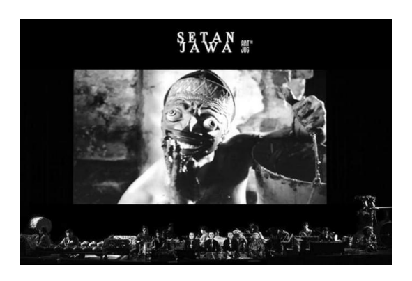
Figure 1. Documentation Film Performances Sine-Orchestra Satan Java

One of the film made, 'Setan Jawa', is the first black and white silent film masterpiece and directed by Garin Nugroho, who was accompanied by a live orchestra gamelan music made by Rahayu Supanggah and premiered in September 2016 at the Jakarta Theater Building. The release of film 'Setan Jawa' in Jakarta is the first appearance before the world premiere screened at the Opening Night of the Asia Pacific Triennial of Performing Arts in Melbourne in February 2017. 'Devils Java' whose documentation is shown in Figure I.1 raised the grand narrative is the beginning of the century 20th as the background story (Garin Nugroho, 2019), in line with the growth of a black and white film once widespread fashion, literature and art forms of entertainment at the peak of Dutch colonialism.