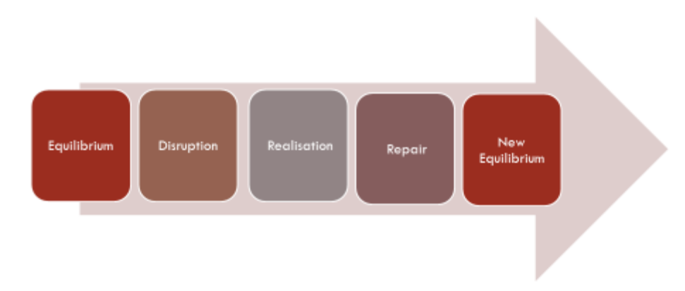
Figure 3 Narrative Structure of the Panji Story

One problem remains in the equilibrium stage in Todorov's narratology model. Using the narrative structure model as seen in Scheme 3, it can be concluded that the narrative story of Panji is not confined in the same physical circle. The Panji story is not a mere romantic love story. The Panji story actually represents human's constant conquest in understanding the origin of his life (sangkan paraning dumadi – the beginning of things) and in uniting with his Creator. It is a story of human's spiritual journey to the higher stage.