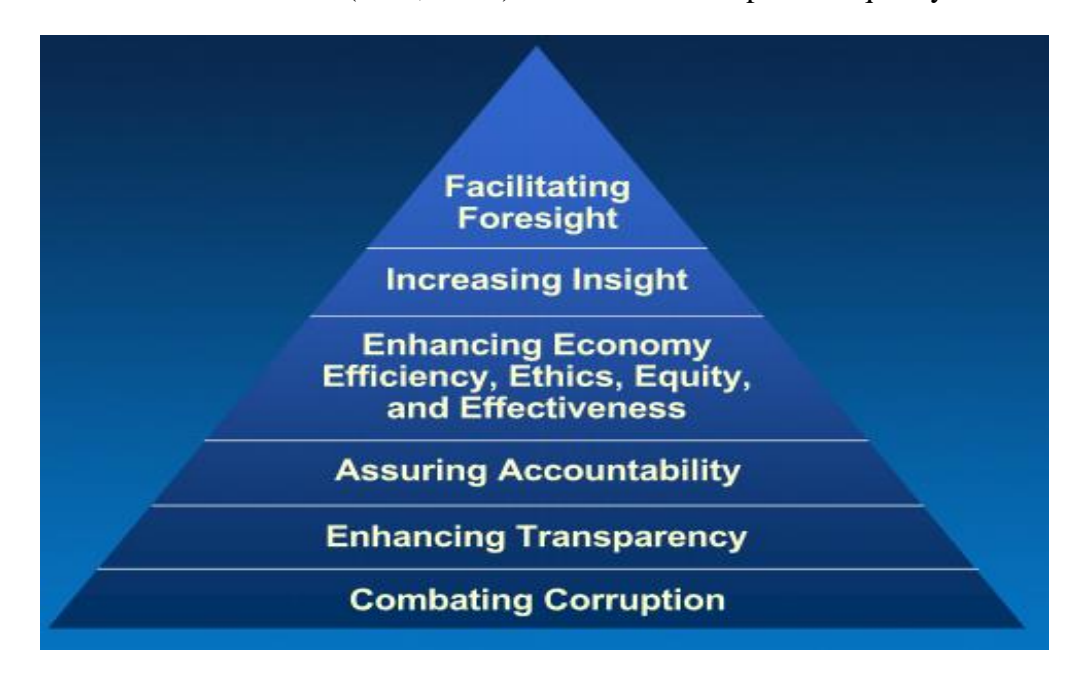
Figure 1.1 Accountability Organization Maturity Model Monitoring Agency According to Intosai

The stakeholders as users of the audit report really want to know whether controls are being followed and whether their controls are working as planned. To find out it depends entirely on the report of the results of the examination. Therefore, the Public Accounting Firm or state audit institution (CPC, APIP) should be able to produce quality checks