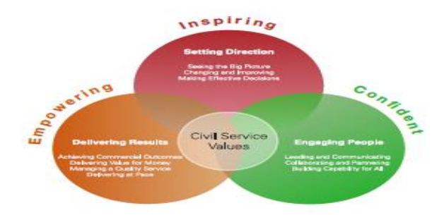
figure 2. Frame Work Pengembangan Civil Service Competence melalui Empowering.

Thus the improvement of competence is very important, in addition to audit fees and professional commitment to produce quality services.