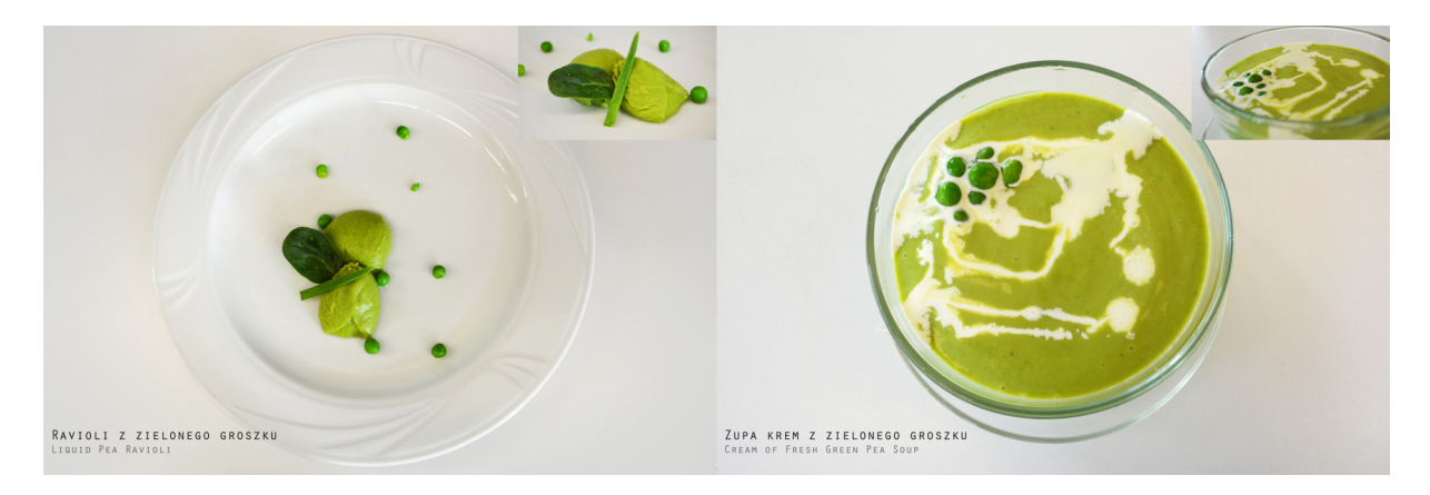
Figure 1. Proposition of the pea dishes plating: A. liquid pea ravioli, A-1 cream of green pea soup.