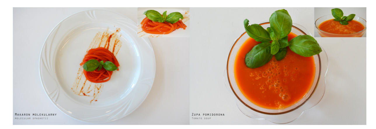
Figure 2. Proposition of the tomato dishes plating: B. tomato soup spaghetti, B-1 pure tomato soup.