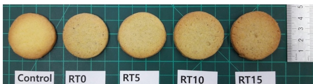
Figure 2. Photographs of cookies containing roasted chia seed powders. Control: without added chia seeds, RT0: with chia seeds (raw), RT5: with roasted chia seeds (180°C, 5 min), RT10: with roasted chia seeds (180°C, 10 min), RT15: with roasted chia seeds (180°C, 15 min).

A photograph of the cookies is presented in Fig. 2. Longer roasting time of chia seeds corresponded to darker and larger cookies. The L (lightness) value of the control sample was higher than that of the cookies with chia seeds and tended to decrease with roasting time. The a (redness) value was higher in groups RT10 and RT15 (2.96 and 4.11, respectively). The b (yellowness) value was significantly lower for cookies with chia seeds as compared with that of the control (28.44). \Delta E (total color difference) was the lowest (38.03) in the control group and increased with roasting time. The dark color of cookies is attributed to the Maillard reaction or caramelization (WALKER et al. , 2012). The dark color of chia seeds affected \Delta E of cookies. Higher pH of cookies contributes to a better browning reaction (MARTINS et al. , 2000).