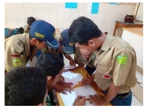
Figure 2. Doing a game