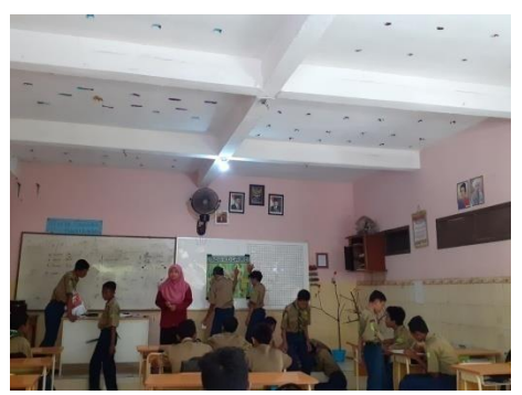
Figure 1. Boad Game