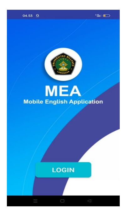
Figure 2. intro menu display