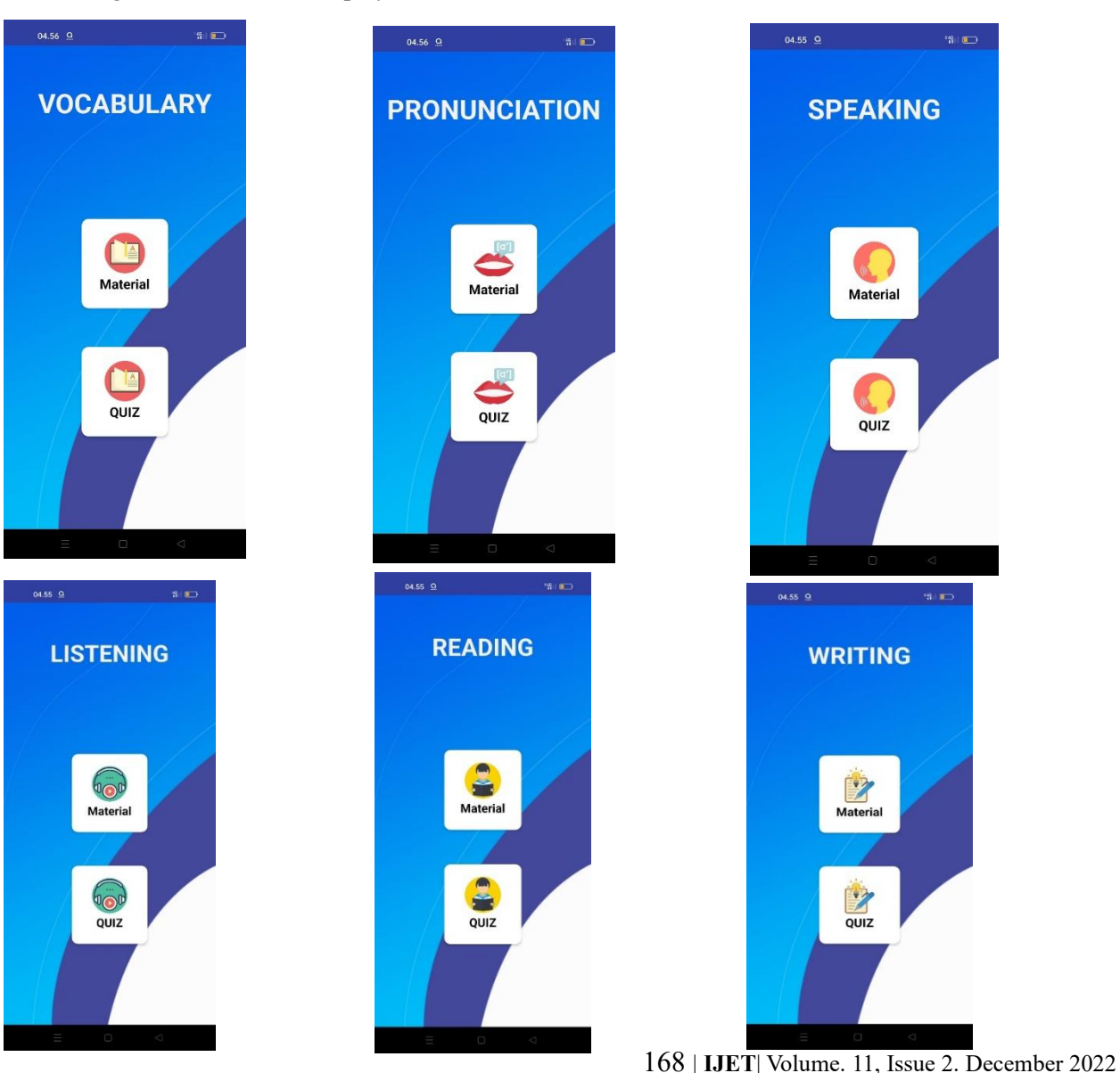
Figure 3. main menu display

Copyright 2022 Anita Rahmah Dewi, Wilujeng Asih Purwani, and I'anatul Avifah, are licensed under Creative Commons Attribution-ShareAlike 4.0 International License.