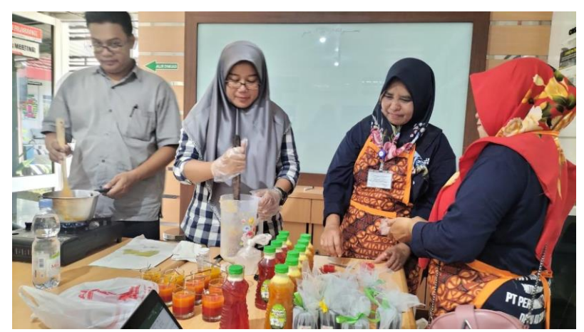
Figure 2. The process of making soap is versatile