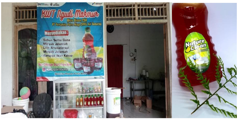
Figure 3. A store selling multipurpose soap and multipurpose soap products