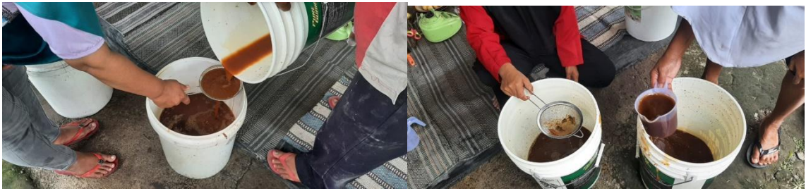
Figure 1. The process of making Eco Enzyme

Used cooking oil can be used through a purification process to be reused as a raw material for oil-based products such as soap (Naomi et al., 2013). Soap is a surfactant used with water to wash and clean stains. When applied to a surface, soapy water effectively binds particles in suspension, easily carried by clean water. Soap is produced from the hydrolysis of oil or fat into free fatty acids and glycerol, followed by saponification (Fessenden & Fessenden, 1997).