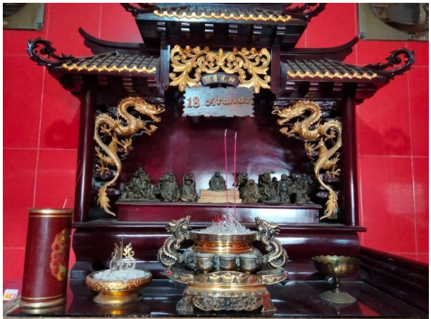
Source: Documentation Study Figure 1. Table made of ink gold often used Suhu For pray to ancestor