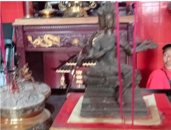
Figure 3. Statue Buddha, Which used Suhu Teddy for offering to ancestor