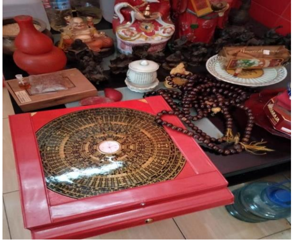
Figure 4. Tools as media for practice consultation