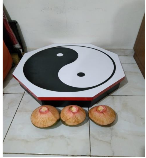
Source: Documentation Study Figure 5 . Tools as media For practice consultation, seen coconut as media for rituals in consulting practice " Feng Shui."

Consultant "Feng Shui" Suhu furthermore that is Suhu Abu Where, the practice consultant "Feng Shui " it has been a while since 1999, meaning that he has been around 24 years professional as a consultant "Feng Shui." Abun's suhu is experienced in building layout, harmony land office, et cetera. In addition, it is believed to hold one monastery big in Sukabumi, So to run a consulting practice, " Feng Shui," back and forth back to Jakarta - Sukabumi. It is also arranged in the monastery by bathing clean up with flower water Buddha statue And goddess statue Kuanim.