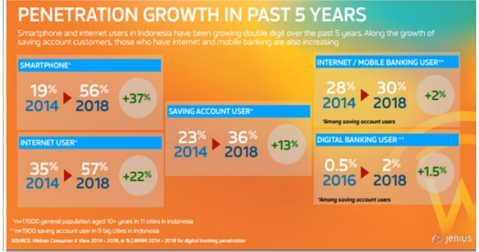
Figure 1. Penetration of Smartphone Usage

Mobile banking offers an easy way to carry out a banking transaction. The advantage of the availability of mobile banking services for banks is that they can make savings to print forms that must be filled out by customers for transactions, including printing brochures as well as catalogs to be replaced by electronic data (Jensen, 2005). Customers who use mobile banking will get information from the banking world quickly and effectively, including efficient and can save time to wait as a customer at the bank when making transactions (Siti-Nabiha, Azhar, & Ali-Mokhtar, 2018).