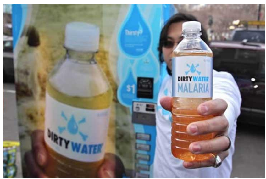
Figure 4. Guerrilla Marketing of UNICEF

The third case of guerrilla marketing was inspired by what happened in New York back to 2009. The United Nations International Children's Fund (UNICEF) put a vending machine that sells dirty water on the streets of New York City. The water bottles were labelled common diseases caused by consuming unclean water. UNICEF did it to increase public awareness of the importance of drinking clean water. The motivation behinds the idea was 3.000 children death in a day because of diarrheal disease and 783 million people were lack of clean water for drink. The consumers were actually expected to donate $1 by buying dirty water instead of drinking it. The guerrilla marketing successfully attracted media attention and shocked people in the town. This is a very effective way of educating people about health and UNICEF with low investment. The aim of this campaign was actually to get $1 Million donation. This vending machine project was successfully deliver its education massage about water crisis, make people surprised and contain a sense of humour, the creativity brought a sensation that motivate people to come and donate as it became a unique experience to them.