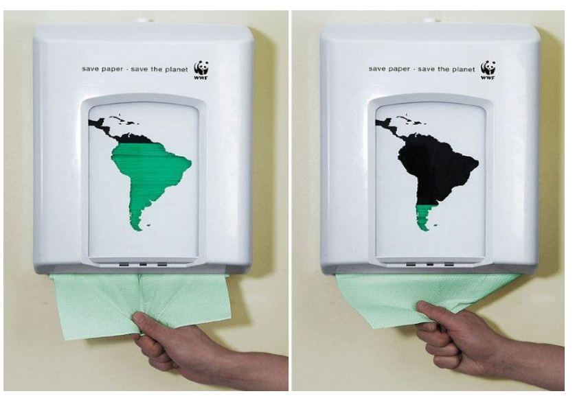
Figure 2. Guerrilla Marketing of WWF

many trees must be cut down to meet the demand of all people in the world. While more than just a raw material for tissue, forests have the function of absorbing carbon. The more forests that switch functions the less absorbent of the earth's carbon. That is why there is global warming and climate change. Based on the results of a survey conducted by WWF-Indonesia in collaboration with the creative agency Hakuhudo, Indonesian people living in big cities have the habit of spending three pieces of tissue to dry their hands. While globally, WWF estimates that every day, around 270,000 trees that are cut down end up in the trash. And 10% of that amount comes from toilet paper.