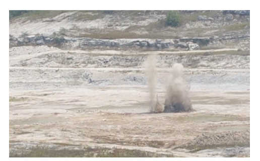
Figure 5. Blasting Activity in Limestone Mining at PT Semen Baturaja