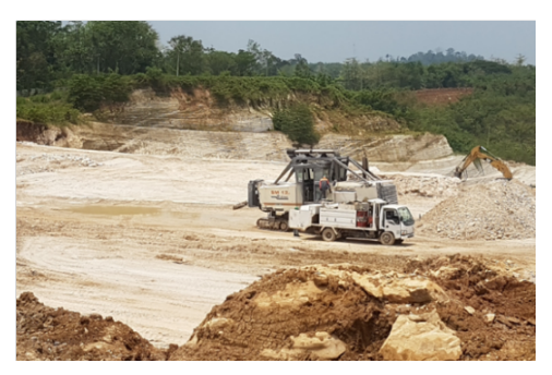
Figure 6. Surface Mining Activity

tion activities. The planned mechanical devices are: