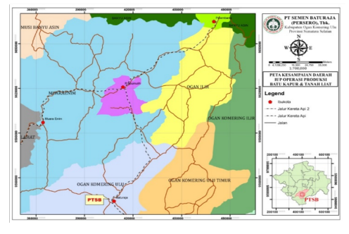
Figure 1. Research Location Map

Data analysis was carried out by analysing the results of mine water quality testing on water quality standards set by the Governor of South Sumatra. Questionnaire data is used as a reference for public opinion on the plan to use voids as a micro-hydro power plant.