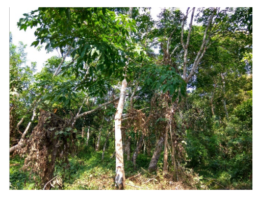
Figure 3. Vegetation condition in Mining area at PT Semen Baturaja

Based on the investigation, batukapur deposits are found in the Gumai Formation and Baturaja Formation with a depth of 25 meters. Based on the characteristics of the overburden and limestone layer, the mining applied is an open pit mine using