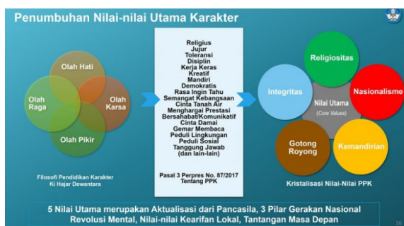
Picture 1. The Core of Character Values

(source: https://cerdasberkarakter.kemdikbud.go.id/?page_id=132 )