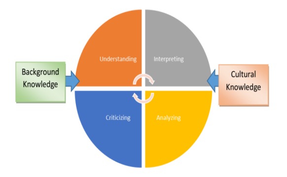
Diagram 1. What Critical Reading

On her paper, Lee (2016) boldly claimed that being critical was being able to expose one's opinion freely but still with ability to connect the personal ideas to some related facts presented in the text. Critical reading was not only about reading passages, but it could also be done for visual text. When reading any text either a non-visual or visual text, someone's personal evaluation towards the text might be influenced by his/her background knowledge related to the text. It would open up a window of differences between one reader to the others because the subjective point of views of one reader was different one to another. The following diagram tried to map the definitions of critical reading as discussed above.