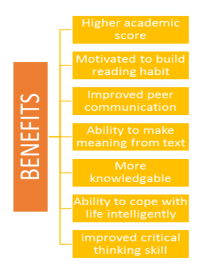
Diagram 4. Possible benefits from critical reading practices

with their lives intelligently as an individual and social person and it was in congruence with what (Gambrell, 1996) mentioned that engaged readers would tend to be more motivated, become knowledgeable and socially interactive and be strategic in terms of balancing skill and will to read. As a result, a reader would be able to get the meaning of the text and to construct new knowledge that might be useful for his/her life (Oliveras et al., 2013). Those possible positive impacts on students' lives were drawn on the following diagram 4.