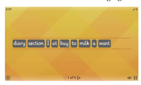
Figure 4. The Construct Word and Translation Design

sentence, "We are moving to the third aisle," was randomized to be "ew - earivomgn-ot- drthi- least." The students must compose letters by letters to form the proper word order. Next, the sentence structure will be wholly formed if all the random words have been composed. This media confused the students when they carried out the long word; for example, the word "bargain" scrambled into "general." The advantage of this activity is that the users make them more challenging.