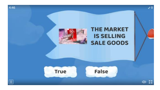
Figure 3. The True or False Task Design

students only have a limited time to read the statement, and then students answer whether the statement is true or false. After all the answers are filled in, each student's scores will appear, and the answer key will be available as a student reference for further learning.