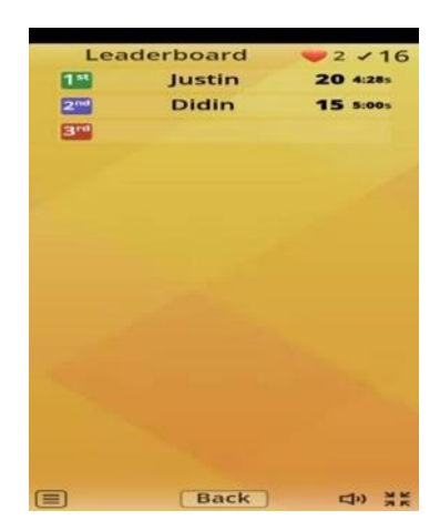
Figure 6. The student's highest score on crossword games

into sentences. The researcher assessed the participants by comparing their scores before and after the activity. The pre-activity assessment was based on highest achieved the score completed 20 participants who questions within 5 minutes. The following are the students with the highest scores in the pre-activity assessment: