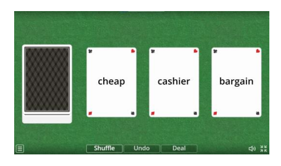
Figure 1. The Random Card Design

The first media in the Wordwall app is the Random Card Games. This game has a design like a Poker Card formed from origami paper or printed paper as a learning device in the class. However, these Random Card Games are digitalformed and only accessible electronic devices such as laptops and smartphones. The Random Card Games are created by purposively selecting words on transactional activities. The words contain 20 transactional activities, for example, aisle, buy, expensive, etc. Once the media is ready for classroom use, the researchers share the game link for the students to access by filling in a username. Filling the identity can make the teacher easy to monitor if the students have opened the link and to score the student's performance.