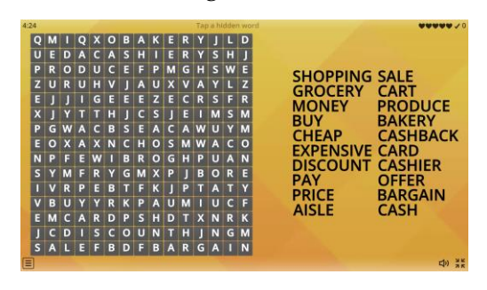
Figure 2. The Crossword Games Design

The second media is the digital Crossword Game. Similar to the one primarily found in magazines or newspapers but this game requires the users to fill in the squares with the answers from the glossary on shopping words. At the same time, the users of digital Crossword Games must click the word in the squares to answer the question. Digital Crossword Games have several colorful design options. There are five design options: cartoon design, space design, sky design, monochrome design, and simple design. researchers chose the simple design without presenting cartoon characters because the target students are not children, so the design is determined based on the target users.