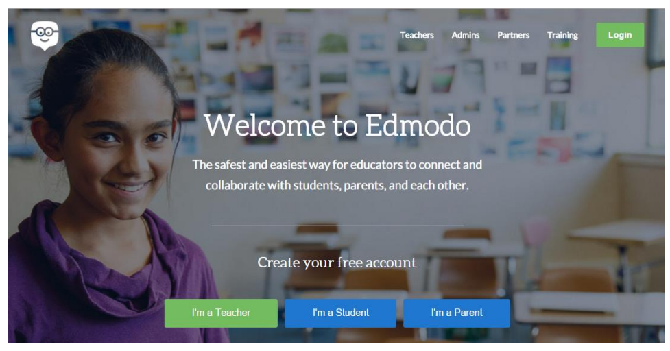
Figure 3. Edmodo Home Page

Besides, the peer assessment system was to make sure that each member of the group was involved in the process of doing the projects. Each member of the group assessed other members of the group using Likert scale of 1-4. Then, the students were asked to submit the rubric at the end of the course. The scored rubric was considered as one of the criteria to determine their final grade in SLA class. The students were explained clearly that the peer assessment could make a significant difference in their final grade, so they should prove their deep involvement in the completing the projects.