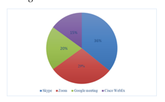
Figure 3. Conference communication Instrument

respondents. Skype, Zoom, and Google's meeting platforms should all capable of supporting workforce's size. As indicated before, most providers provided a free plan with a standardised meeting volume often among 100 and 200 members. In addition, the Cisco WebEx platform facilitates business video most conferencing tools that allow users to share files, and others provide many collaboration features such as video call. live file description, implementation with popular office productivity apps. However, interactive online communication is contingent upon qualified instructors' adequately planned and guided educational Furthermore, because experiences. learners have various learning styles or a mixture of types, the educational should develop program various learning modes. Additionally, instructional paradigms should modified to the new instructional settings.