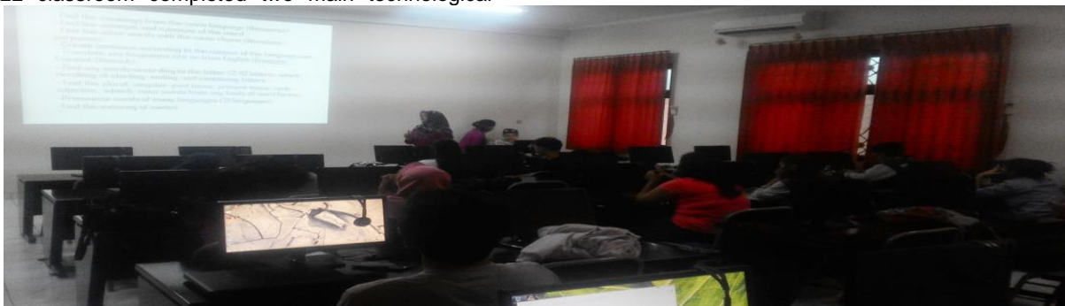
Figure 1: The Classroom Presentation

based projects that were done in a group of three to four students. With regards to Mali's (2017) elaborations, the first project was [a] technological workshops. In this project, the teacher gave students a general technological topic (e.g., google facilities, social networking sites, and educational games) or a more specific technological application (e.g. Wordhippo , ScreenCast-O-Matic , and Kahoot ) to be presented in the classroom. The first presentation is in the form of PowerPoint slides that discuss principles of CALL evaluation by Chapelle (2001). For instance, the students had to explain related definitions of the technology and discuss who will be the best users of the particular technology, how interactive the technology is, and how the technology can provide language learning activities for its users. Figure 1 illustrates the presentation.