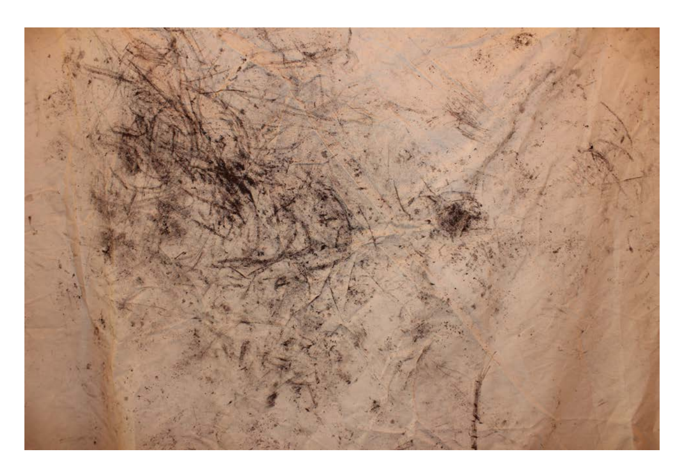
Figure 3. Dirt on canvas.

Our next stories move us further into paint's viscosity. Each type of paint has a different thickness, or viscosity. Oil paint is thicker than tempera paint, for example, and our oil paint stories become thicker, too.