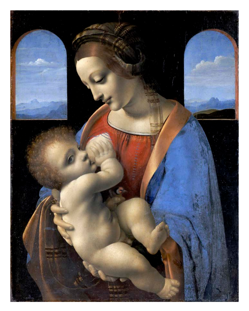
Figure 4 . Leonardo da Vinci's Madonna and Child (with the permission of The State Hermitage Museum, St. Petersburg, Russia).

During the period of Renaissance art, tempera paint storied many religious images of the virginity of the white mother of "our" saviour. Paint made from the ultramarine blue mineral lapis lazuli was the most expensive and was imported to Italy from what we now know as Afghanistan. Blue was therefore the most valued colour, and it was reserved for special tasks, such as becoming the white virgin's gown (Drogin & Zucker, n.d.). In the 19th century, a synthetic version of ultramarine blue was created (Fuga, 2006).