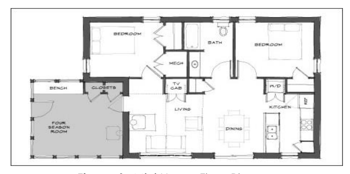
Figure 4. Mini House Floor Plan.

Second (lower floor): The lower floor has two guest bedrooms, one of which might be used for an office, and a bath. At the rear, there is a large storage and utilities room. For those who might need it, this floor could also be used as separate living space for a caregiver.