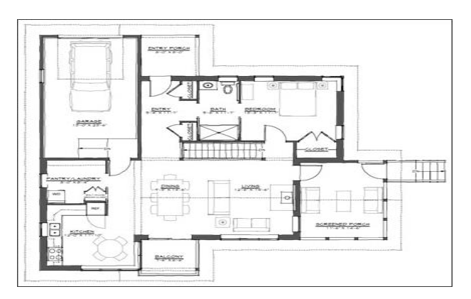
Figure 2. The Community Building, Upper Floor.

Nestled into the hillside will be 17 south-facing houses in two clusters. The lower cluster of 12 three-quarter-acre lots will comprise Phase I along Crosier Lane; Phase II the upper five-lot cluster along Stowe Farm Lane. Between the two clusters is the existing house, a large redwood home built in 1972 with five guest rooms, a large party or meeting space, kitchen, library, and workshop. This building will serve, at least for the time being, as the community house.