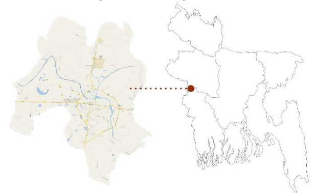
Figure 1: Jhinaidah, on the map of Bangladesh (Google map, 2016)

The national focus on economic development has taken Bangladesh a long way, even with some complex problems (overpopulation or natural hazards). In a short period of time, Bangladesh is on the verge of becoming 'middle income country' from 'developing country'. The economic development of the cities is driving people to come to the city for work, and Jhenaidah is no exception. So, when new people are coming to the city everyday, the need of housing is increasing.