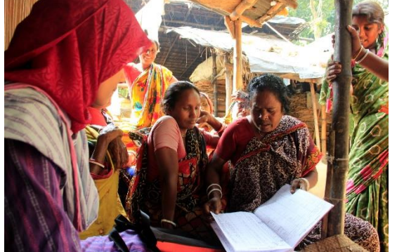
Figure 9: Community leader from Mohishakundu helping with book keeping in Shoshanpara community.

Shatkhira (a municipality from south of Bangladesh) to share experience with local communities, municipality and NGO (Brac). Jhenaidah leaders are preparing to attend Asian hub meeting of in Mumbai, arranged by ACHR and SDI to share their experience about settlement profiling. Thus the city-wide networking is expanding to nation-wide networking and to international platforms by horizontal sharing of knowledge.