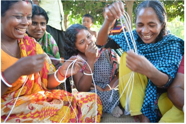
Figure 5: Women group is considering to invest their time in craft-based product making (Farzana, 2016)

Over the time as the saving grows bigger, the community member are also being able to take small loan for emergencies or investing in small entrepreneurships. This has in two positive results: firstly, the community members are becoming independent from outsider micro-financing organizations and trier loan cycles. Secondly, they can think about economic development through businesses.