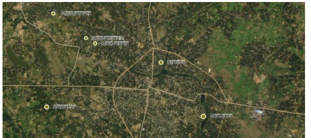
Figure 2: Geographical locations of communities of the citywide

2. Background of the community-led development project Initially, five low-income communities had formed a city-wide network. Currently, this network has 9 communities as members and few more as interested. The basis of creating the network was to start saving group within community. The member communities have been saving since 2015. After the communities started saving, they were eligible to apply for a seed fund from ACHR (Asian Coalition for Housing Rights). ACHR usually gives two kinds of fund for city-wide development; fund for building houses and for small infrastructure upgrading, such as waste management, drainage or community space making. Citywide network at Jhenaidah has received funding from ACHR for two consecutive years. The idea is to include this as seed fund in a revolvina loan system. Two beneficiary communities have developed housing with this fund and they will be repaying to city-wide network. Then the next communities in pipeline will receive the fund. The network aims to expand the fund from their own savings along with the external funds. Since 2015, the communities of Jhenaidah have built 45 houses In the first in total. year (2015-2016), Mohishakundu community built 20 houses. In the second year the same community built 8 more houses. In the second year (20116-2017), Vennatola community built 18 houses.