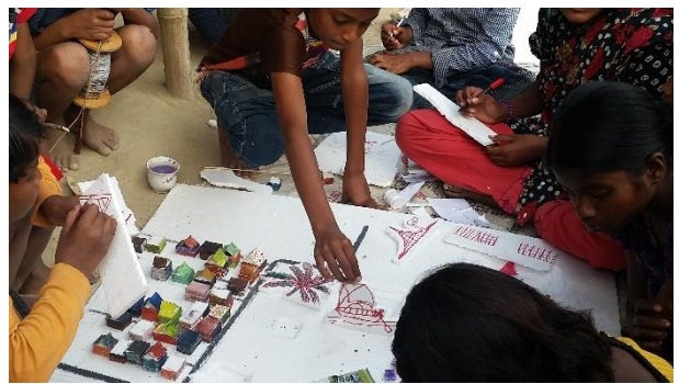
Figure 7: Children designing their desired playground