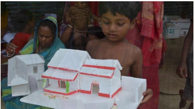
Figure 6: House designed at dream house design workshop (Co.creation architects)

Based on these discussions, the architects designed two prototype houses and through repetitive consultations with the community. At construction the prototypes adapted to each household need. As a result, the houses became visually unique to each other. During a discussion, women at Mohishakundu Shordarpara (the first community) have expressed how the process of collaborative design has changed the perception of their own capacities, one woman said: "We feel like now we can make our houses ourselves. The other day we were discussing about the budget to build the first story of our house and my daughter suggested that she could make it with half the money! The way apa (Architect Farzana) has worked with us, we feel like we are architects now!" (Mina, 2016).