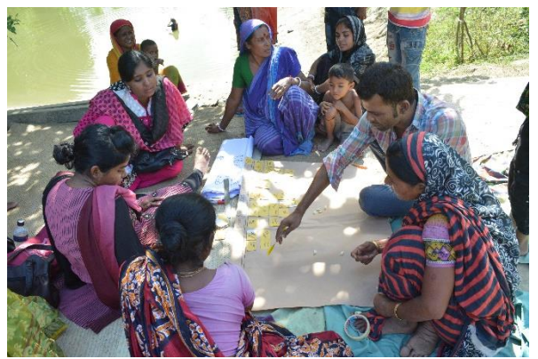
Figure 8: Community mapping, one community teaches another community how to map

Mapping is a tool through which the people of the community (ies) visualize resources. problems, opportunities and solutions. The mapmaking process works as the first step to each participating households' translate intangible ideas about housing into something tangible. Gradually, by adding layers of information and understanding, the community collectively creates a representation of their current situation and their future aspiration.