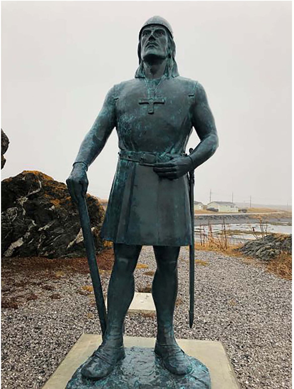
Figure 4. Leif Erikson statue at L'Anse aux Meadows National Historic Site