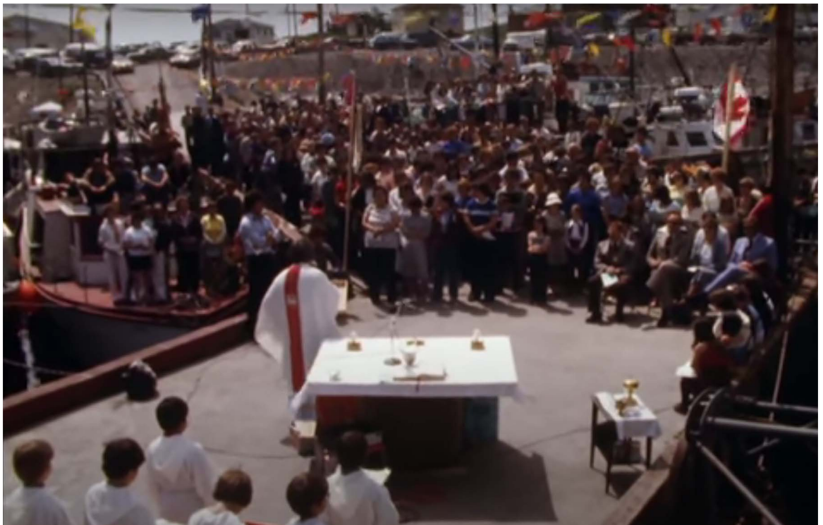
Figure 3. Boat-blessing ceremony in Port au Choix, 1980

Nonetheless, residents also acknowledged that the past had problematic elements. For example, the role of women in sustaining communities was discussed as both an important element of traditional livelihoods and a part of the region's history that is often undervalued by both local leaders and external actors. One