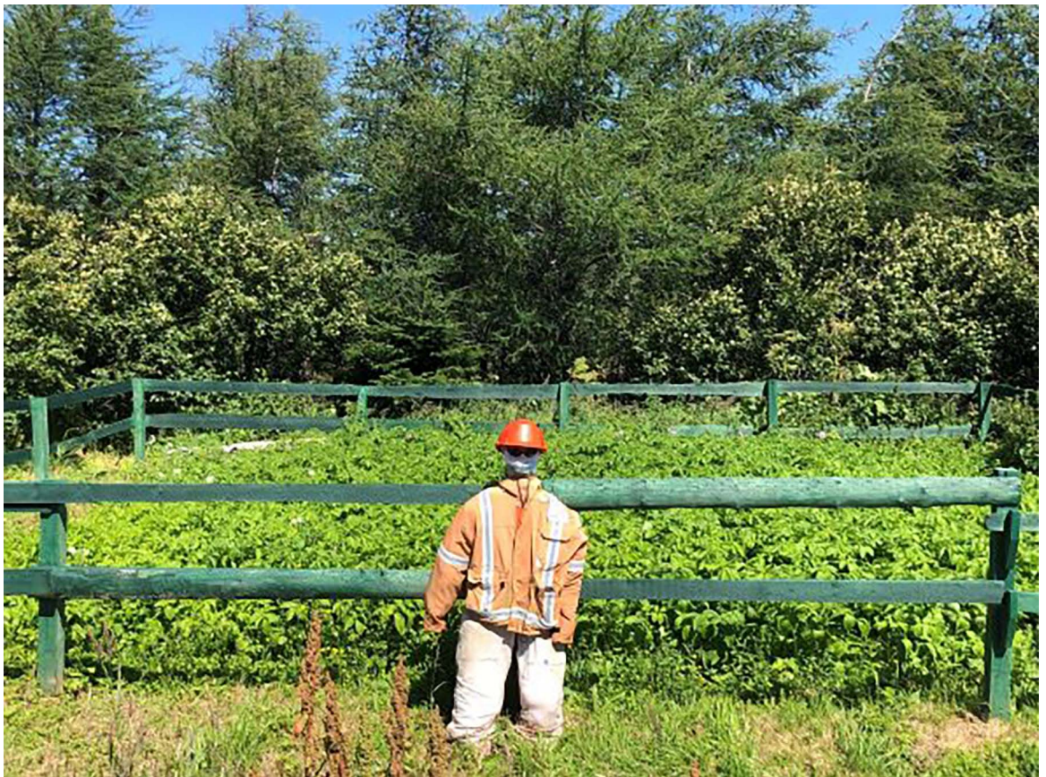
Figure 5. Roadside garden near St. Anthony Bight

To restore this connection, residents discussed traditional practices, such as food self-provisioning, as a way for younger generations to rediscover local ideas of wellbeing. Self-provisioning activities are important