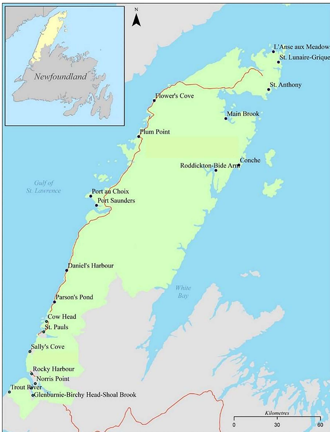
Figure 1. Map of the Great Northern Peninsula

use socio-economic indicators to tell a negative story about rural NL, highlighting the province’s economic uncertainties to justify withdrawing public services from rural regions. When releasing the 2021 provincial budget, Finance Minister Siobhan Coady stated that ‘solutions are needed to address long-standing structural issues, such as the high cost of providing services to nearly 600 communities across a large