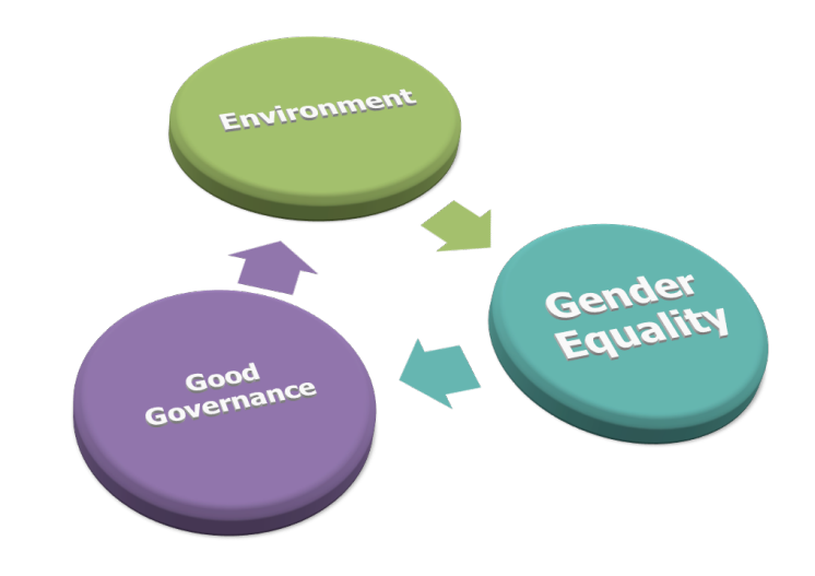
Figure 3: Crosscutting issues

In working with communities, the pokja takes into account several mutually reinforcing 'cross-cutting issues', as shown in