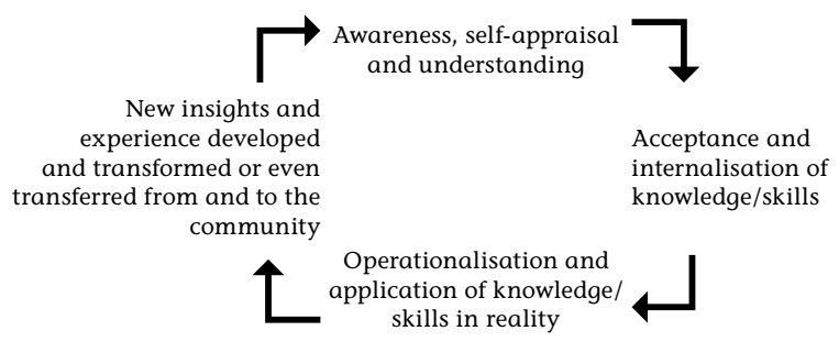
Figure 2: Knowledge building, application and transfer through service-learning

Throughout the process, a cycle of reflective learning is developed. New concepts may also be created as a result of this, upon which another cycle of learning begins. That is to say, learning has to go through several stages: awareness and self-appraisal, internalisation of what has been learned, and understanding of how the knowledge can be operationalised and new skills and knowledge developed and transformed, and even transferred from and to the community (see Figure 2).