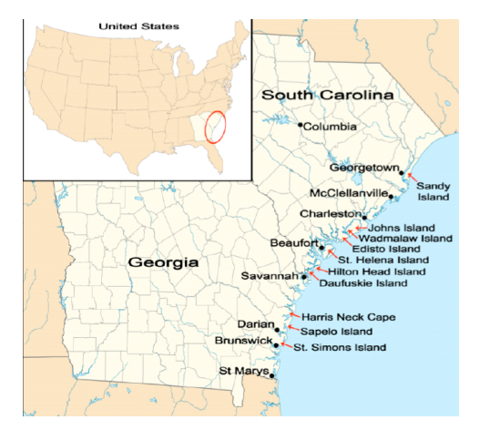
Figure 2: Sea Islands of South Carolina and Georgia (the 'low country' region). Map drawing courtesy of Jennifer B. Lessard

(Jones-Jackson 1987). Historians report that colonists in Carolina sought out Africans from the 'grain coast' of West Africa (Opala 1985; Pollitzer 1999) because of their rice-growing expertise: the SC low country was similar to the topography of West Africa and ideally suited for rice cultivation (see Figures 1 and 2). The Gullah language, an English Creole very similar to the modern-day language (Krio) spoken in Sierra Leone, is the preserved spoken language of the Sea Islanders (Opala 1985).