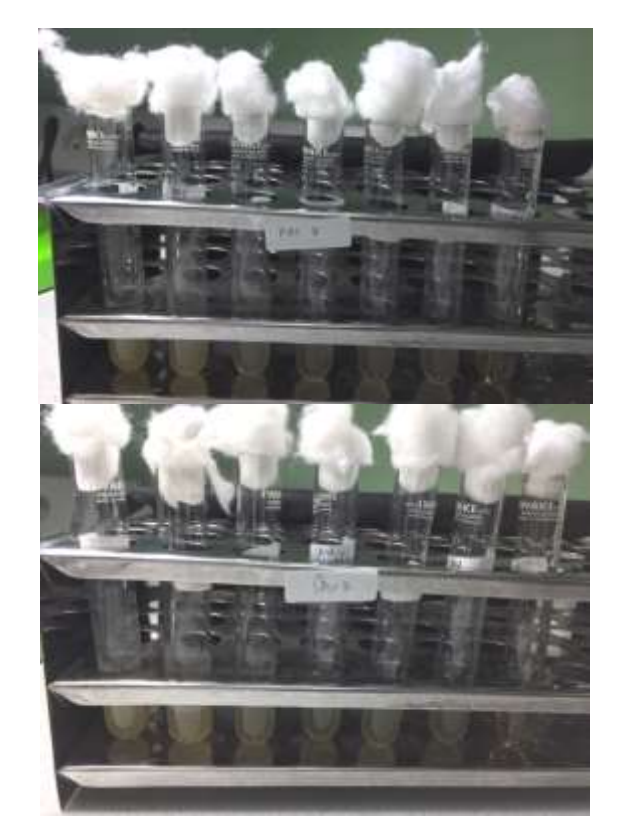
Figure 3. Result of MIC eco-enzyme P.acnes (upside) dan S.aureus (downside)

In solid dilution, the test bacteria were inoculated on NA media containing eco-enzyme with a certain